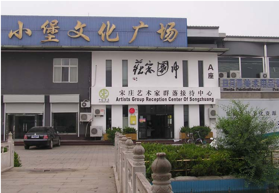
Figure 06: The Entrance View of the Artist Group Reception Center of Songzhuang