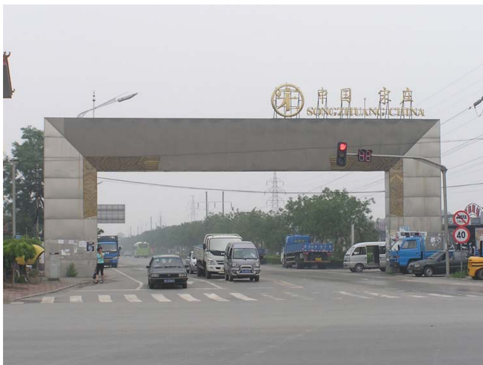
Figure 07: The Archway with “SongZhuang China” that Crosses over the Main Street Leading to Xiaopu Village