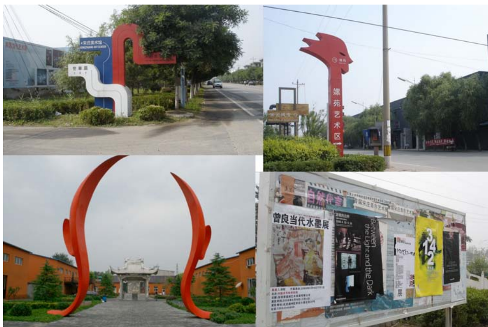
Figure 02: Road Signs, Sculpture, and Poster Board in Xiaopu Village