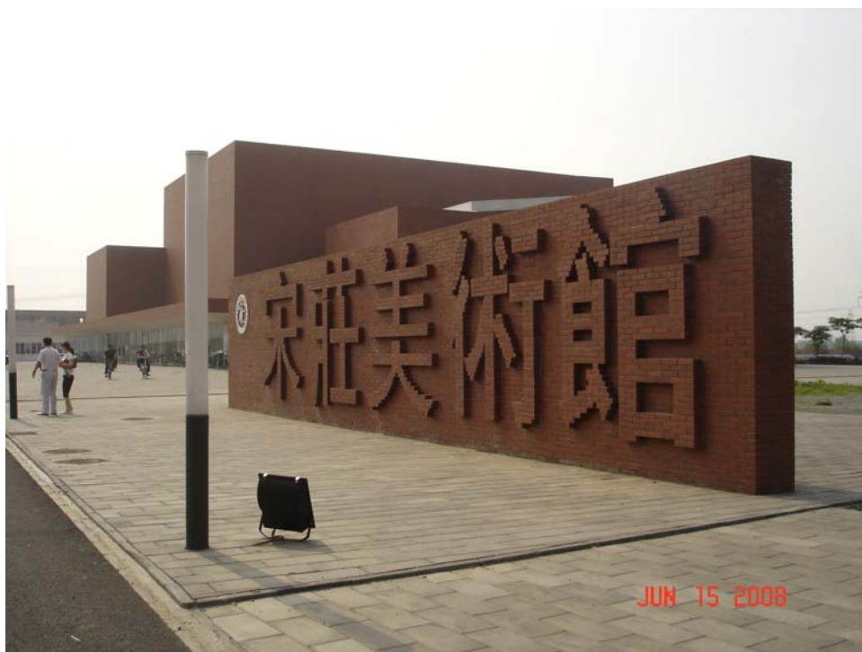
Figure 09: Exterior View of the Songzhuang Art Museum