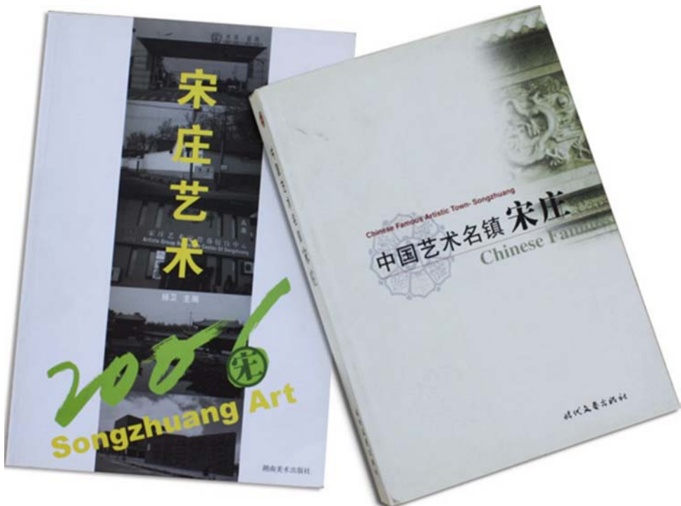
Figure 10: Left: Annually Published Songzhuang Art ; Right: Zhongguo Yishu Mingzhen Songzhuang [Chinese Famous Artistic Town Songzhuang]