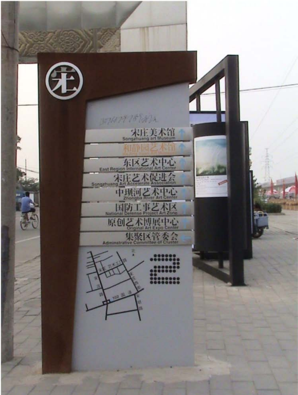
Figure 08: Road Sign by the Archway