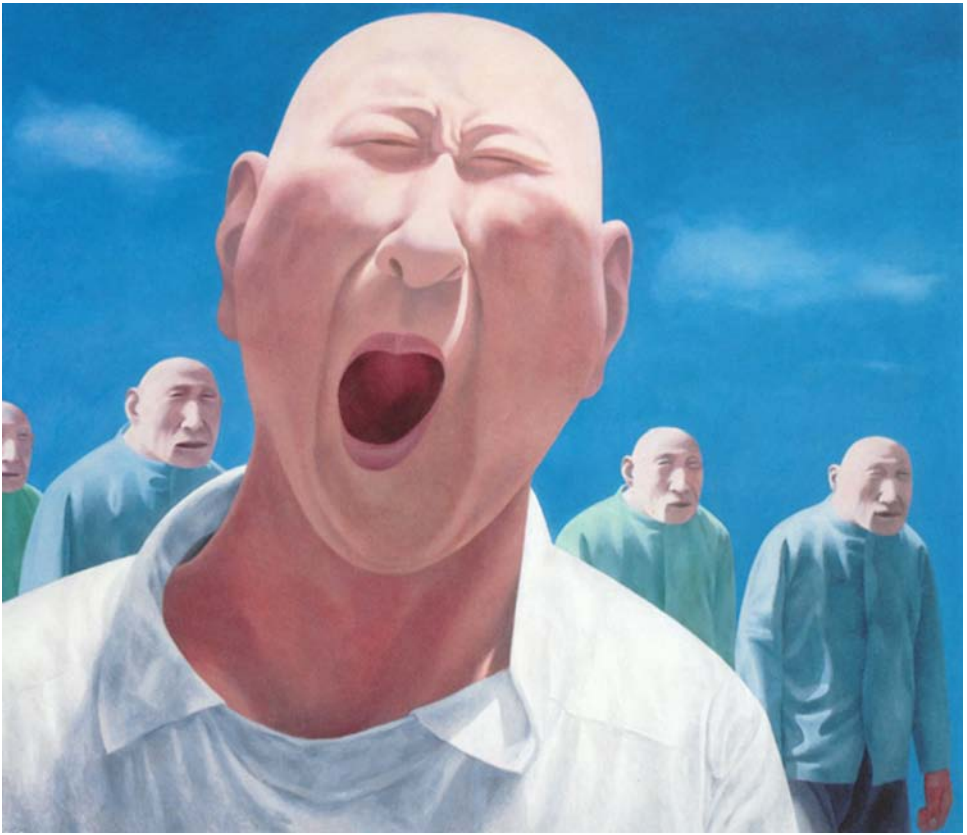
Figure 04: Fang Lijun, Series II, No. 2 , 1992, Oil on Canvas