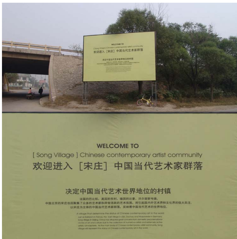
Figure 05: The Bulletin Board on the Road to Songzhuang Town with Headline “Welcome to [Song Village] Chinese Contemporary Artist Community