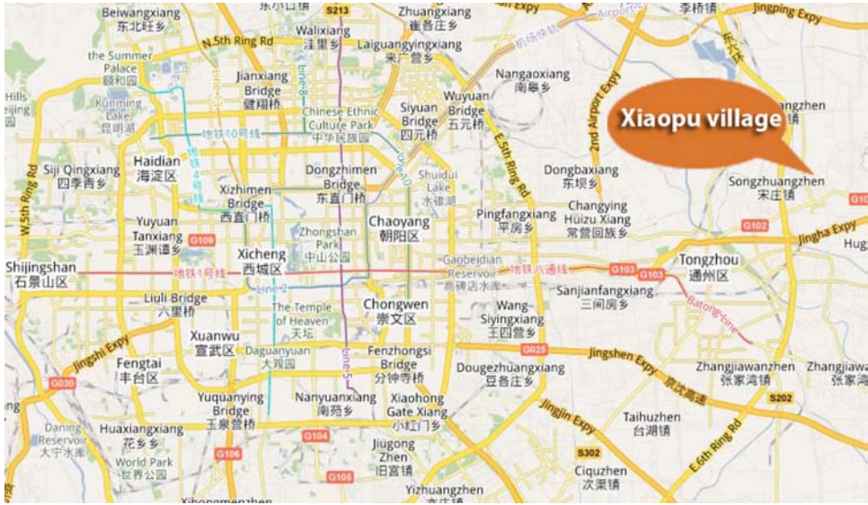
Figure 01: The Location of Xiaopu Village in Beijing